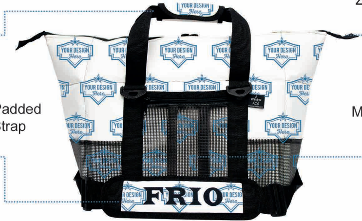
Zipper Grip Points