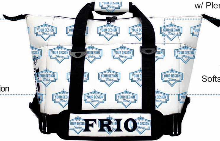
Holds 18 Cans w/ Plenty of Ice