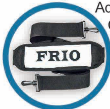
Adjustable Padded Carrying Strap