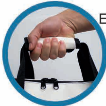
Easy Grip Handle