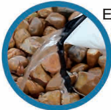
Easy Funnel System